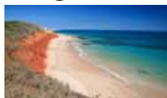
Going, going ... not gone yet.

Certainly, it is another blow to petroleum giant Woodside and the state government which have seen the $30 billion plan attacked on multiple fronts. Many grey nomads and others