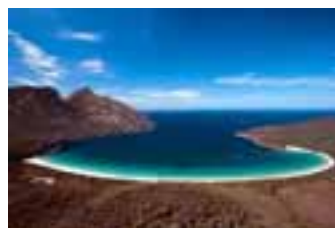
Wineglass Bay is a highlight of this incredible drive

After returning to Tasmania proper on the ferry, northward bound travellers will enjoy some truly spectacular views over Oyster Bay as they head their way towards Swansea. Just before arriving at this pleasant town though is Spiky Bridge, which is famed for its unusual 'spike' feature and which was built by convicts in 1841. Indeed, former convicts